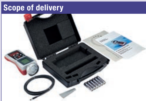
Stroboscope RT STROBE pocketLED LASER (device version with trigger / device version without trigger), operating instructions, calibration certificate, cable with plug for trigger signal, reflective tapes, 6 x AA size disposal batteries, case

General > Contact-free measurement of rotational speed or frequency of moving objects. Ideal illumination tool for high-speed video recordings.