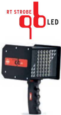
Part number A4-3500