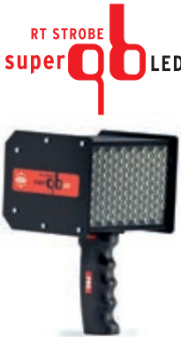
Part number A4-3550

Stroboscope version qbLED (40 LEDs, without laser) or super qbLED (118 LEDs, with laser).