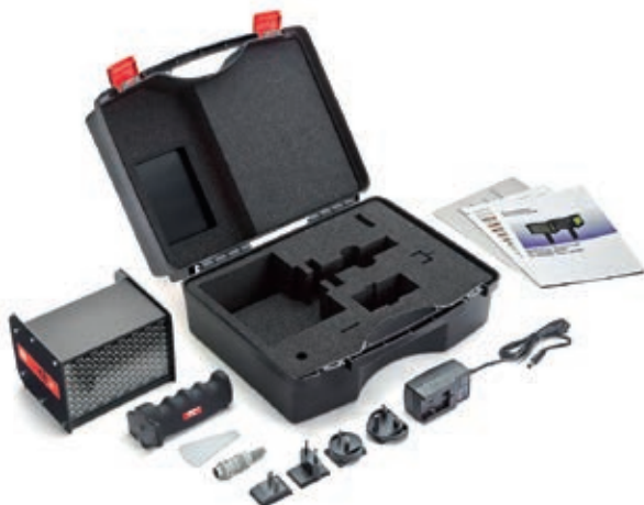
Operating instructions, calibration certificate, charger with connector set, trigger plug, reflective tapes (Version super qbLED), handle, case.

Example: when scanning a cog wheel, an external trigger (e.g. rotational speed sensor) sends out a signal for each cog scanned. With a DIV value of 10, it will only flash once in every 10 signals.