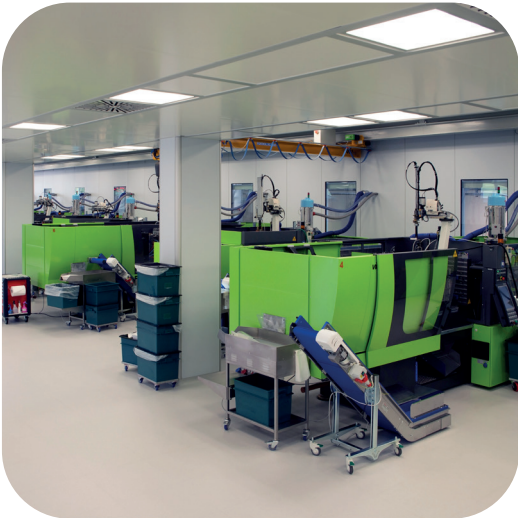
Stationary industrial applications