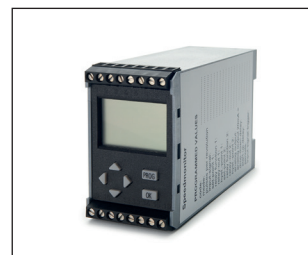
Speed monitor rotas

The programmable rotational speed monitor can be set up very variably taking various system requirements into consideration. Its functional features make it possible to clearly set an alarm case and record it reliably.