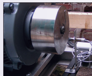
Rotational speed sensor on the generator